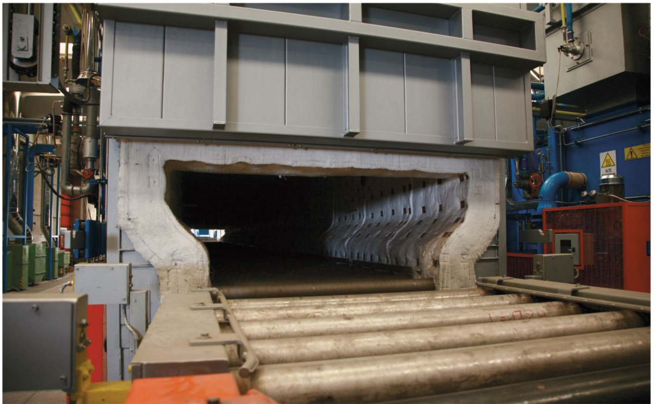
▲ Continuous Roller Hearth Heat treatment furnace in Electrical heating.